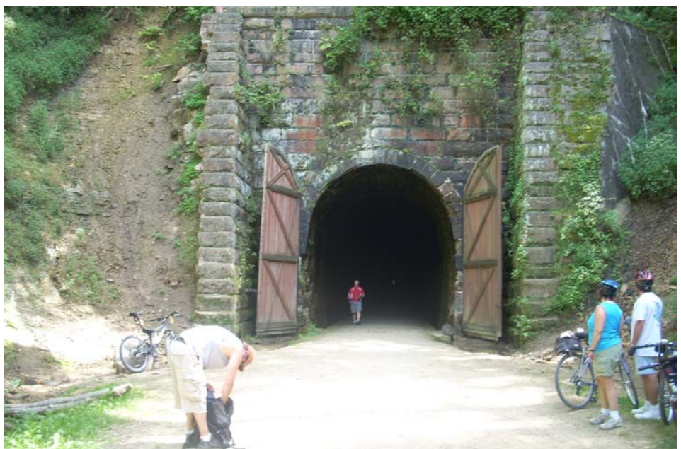
Sanctuary does the Elroy-Sparta, Wisconsin bike trail—August 27, 2011.