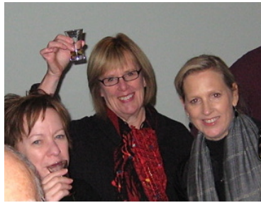
Schnapps to you!